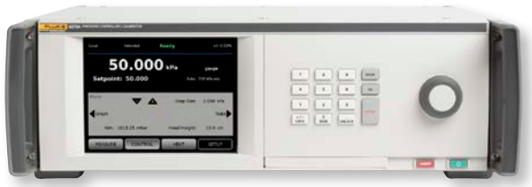
The 6270A includes internal pressure relief valves and designed-in pressure safety ratios to ensure operator safety.

If your goal is to be accredited, then you'll want to make sure that your calibration standards have an ISO 17025 accredited calibration. Almost all pressure standards from Fluke Calibration come standard with an ISO 17025 accredited calibration. Those that do not have accredited calibration standard have it available for a nominal additional fee.