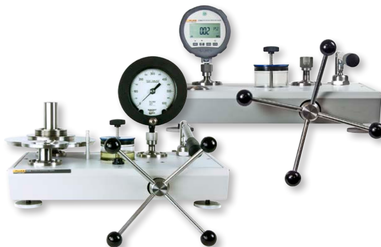
For pressures above 3000 psi, consider either a hydraulic deadweight tester like the P3124 or a pressure-comparator-based solution like the P5515 and 2700G Reference Pressure Gauge.

modules later, without requiring you to send the system back to the factory for re-tuning or re-configuration. There are two different pressure module accuracy classes available. You can keep your initial investment low by starting off with the lower accuracy PM200. As your pressure calibration business grows into higher accuracies, your pressure controller can grow with it by simply adding a PM600 high accuracy pressure module. Finally, when your needs grow beyond the accuracy available through the PM600 pressure modules, the 6270A can be used as a component in a PG7000 piston gauge system, providing the highest levels of accuracy in an automated package. In this manner, your