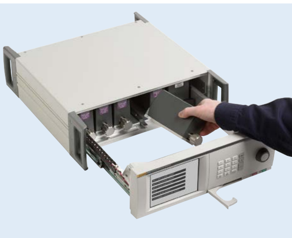
The Fluke Calibration 6270A Pressure Controller/Calibrator has a modular design that lets you purchase what you need now and add more pressure capability later.

In addition, Fluke Calibration provides other educational opportunities such as our online library of application notes, free web seminars, and presentations at local and national industry group meetings (like NCSLI). This includes technical notes explaining how to generate uncertainty budgets for our products, simplifying the challenge of the accreditation process for you.